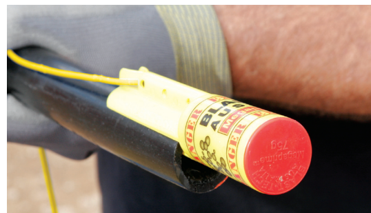
4. Push the ANFO hose and the Mighty Atom down the borehole, ensuring that the primer is at the butt. 5. Charge the borehole as normal with ANFO or emulsion.