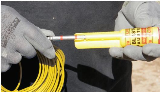
1. Insert the detonator into the capwell.