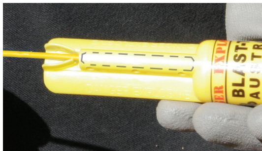
2. To ensure that the detonator cannot be pulled out of the Mighty Atom, the rubber end plug of the detonator must be pushed past the end of the retention lugs.