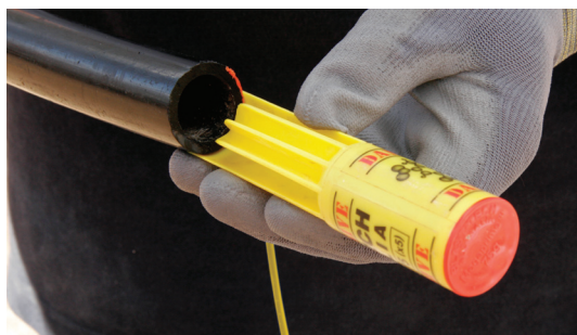
3. Insert the Mighty Atom's loading guide onto the end of the ANFO hose.